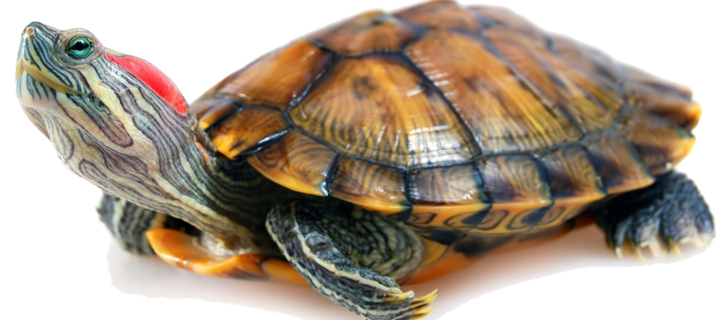
Figure 1: Red-eared sliders are attractive as juveniles, but quickly grow large and become aggressive. As a consequence, pets are often dumped into local waterways and wetlands.

Red-eared slider turtles ( Trachemys scripta elegans ) are the most highly traded turtle species worldwide. In Australia, illegally-kept sliders are long-lived (50-70 years) and can be released into the wild, either accidentally or when they outlive their captivity. After release, sliders have the potential to establish wild populations, posing a risk to native turtle populations [3] . Red-eared slider populations are established on every continent except Antarctica [3] .